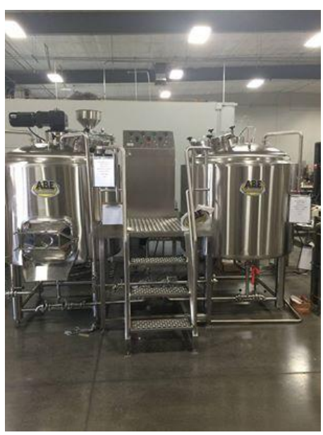
Brewhouse nears completion

Harrison, both say that the loan could not have come at a better time. This loan helped to create the micro brews and helped them stay on track for a January 2015 opening. The VBC plans to brew fresh and creative artisanal ales in the Upper Eagle River Valley area using crystal clear mountain water and ingredients sourced locally as much as possible. Their plan is to hire locally as well and create a real community atmosphere.