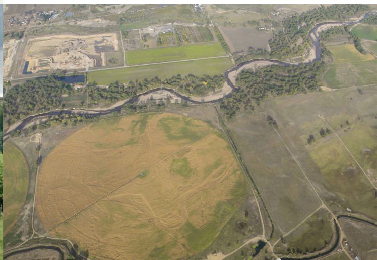
Jeremy Stapleton; aerial support provided by LightHawk