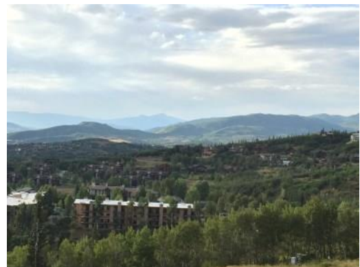
Figure 1: Steamboat Springs development

While these bills were not perfect, they each would have taken a step to encourage local governments to better integrate water planning with land use planning while allowing local governments the freedom to choose the best way to do so. It is clear coming out of this session that there is an opportunity to dialogue and better understand different perspectives on what legislation might accomplish and what other opportunities exist to better integrate water and land use planning.