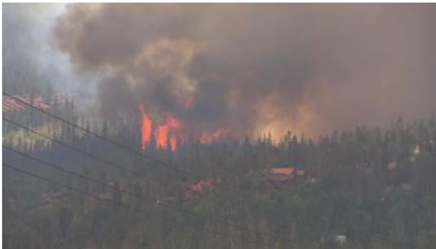
Buffalo Mountain Fire

to enter the WUI zone as they would have preferred. Stiegelmeier also noted that she would like to see "more conservative protocols consistent across the forest and neighboring counties" about fire restrictions. Summit was hampered by a readout error from the one weather station in their county that is used to measure ERFC. It was inaccurately under reporting the data as 70% when protocol says it needs to be 90% to trigger restrictions. The PPT for the Buffalo Mountain Fire is on the NWCCOG website with the August 16th meeting documents . The focus on fire restrictions consistency were a consistent theme of the Council