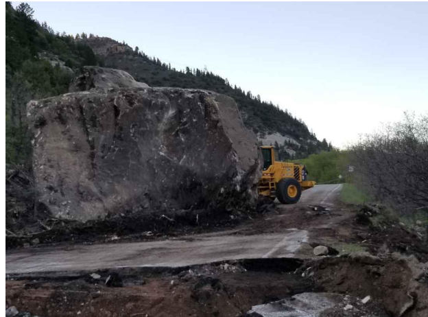
Perhaps an unfair image, but real nonetheless.

It may not surprise you to know .... forty seventh according to the Reason Foundation . Rural pavement in poor condition rating - 47th in the nation, just above Alaska and two states without data! If you are into transportation and really like metrics and rankings, the study is quite interesting. It was referred to during a recent tour by representatives from the Colorado Department of Transportation who have been making the rounds to Transportation Planning Regions and just wrapped up a listening tour of all TPR regions and have highway segment by segment feedback as a result that will result in a document called "The TPR Vision."