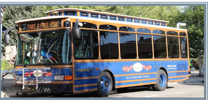
2 Published September 2023 - NWCCOG.org