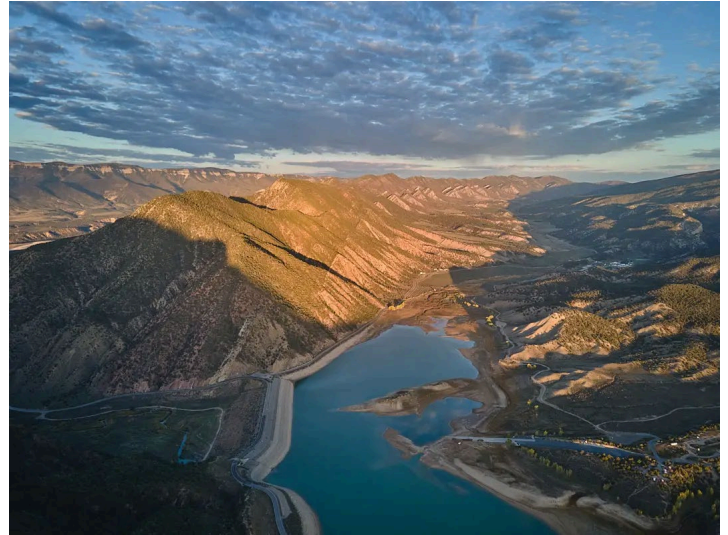
The Grand Hogback ACEC outside of Rifle, Colorado, one of the landscapes considered for oil and gas closures in the draft plan.

With this new plan, we have an opportunity to ensure that these important lands are protected from oil and gas development, and that the BLM thoroughly considers climate change impacts in land use decisions.